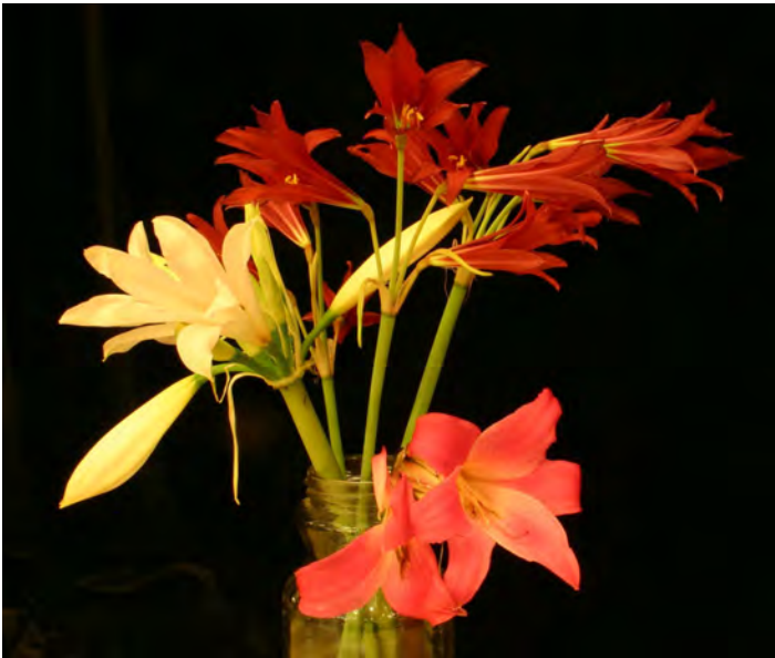
Amaryllis belladonna (white and deep pink, left and below) and Rhodophiala bifida (red, above right)