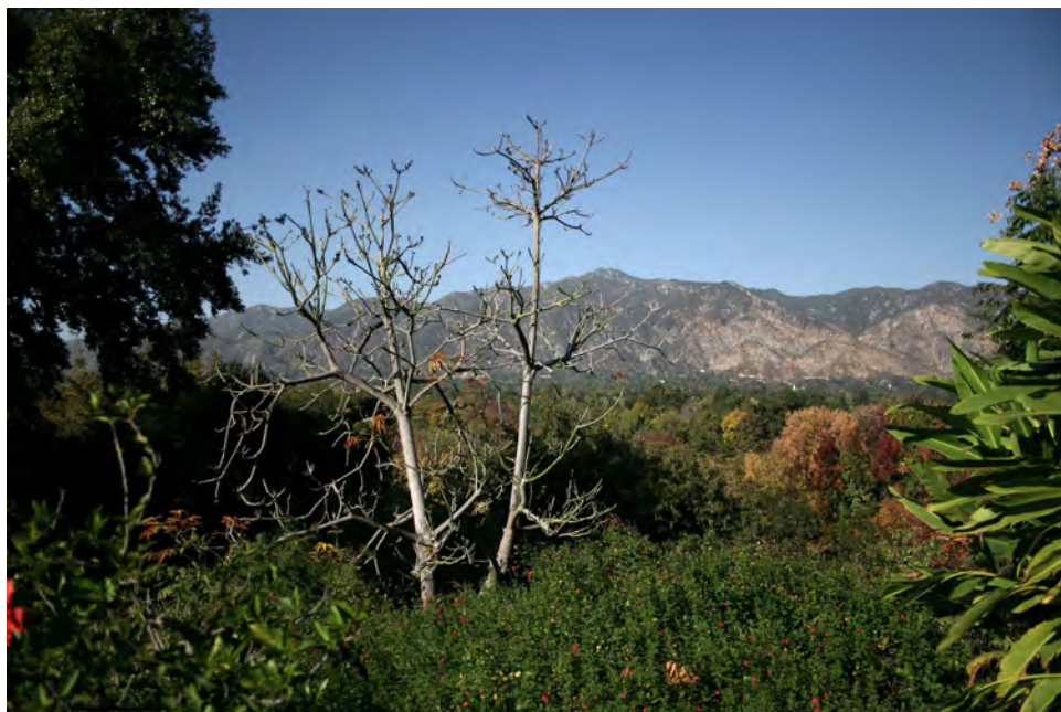
View from Talech Knoll at the L.A. County Arboretum. The (mostly leafless) tree in the foreground is Pseudobombax grandiflorum .

fog started to haze out the long-view they made a striking statement against the blue horizon. And as summer blazed on we all watched apprehensively as fires threatened to burn the chaparral down to the borders of picturesque Sierra Madre. Now things have quieted down and fall has descended upon us. The other day I was teaching a class about fall-season plants at the Arboretum. As we were walking through the grounds, surrounded by salvias in full bloom and maples turning