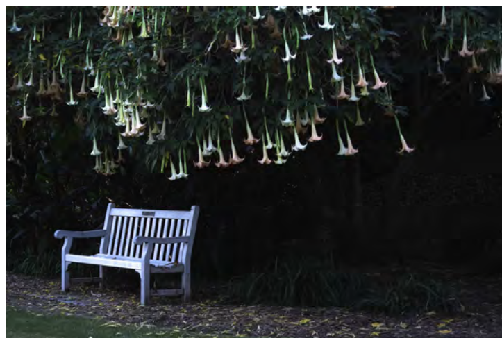
The Los Angeles County Arboretum & Botanic Garden tour "From the Stairway to Heaven to the Gates of Hell: Sacred, Spiritual & Ritual Plants" (in the Around the World in 127 acres series) will highlight this peach-colored form of Brugmansia versicolor and other plants in the Arboretum's collection that have spiritual, religious, and ritual significance to the cultures where they are indigenous.