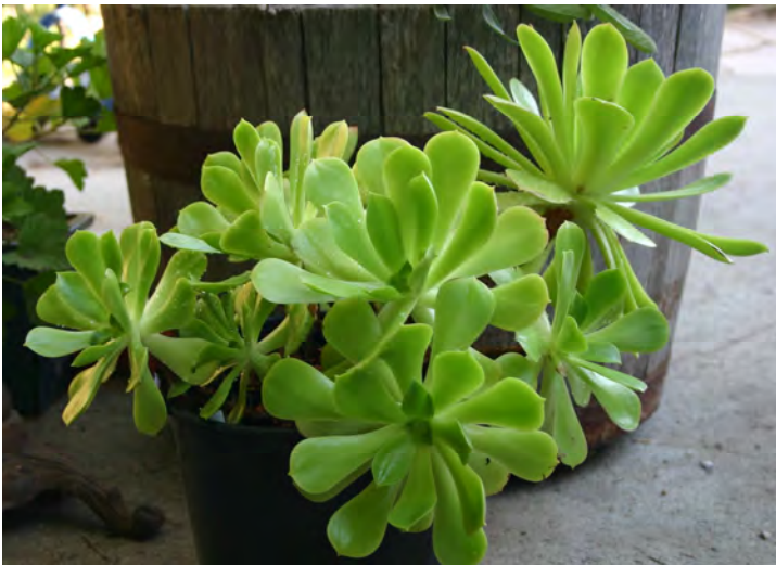
An unnamed Aeonium hybrid received at the 2007 Plant Exchange