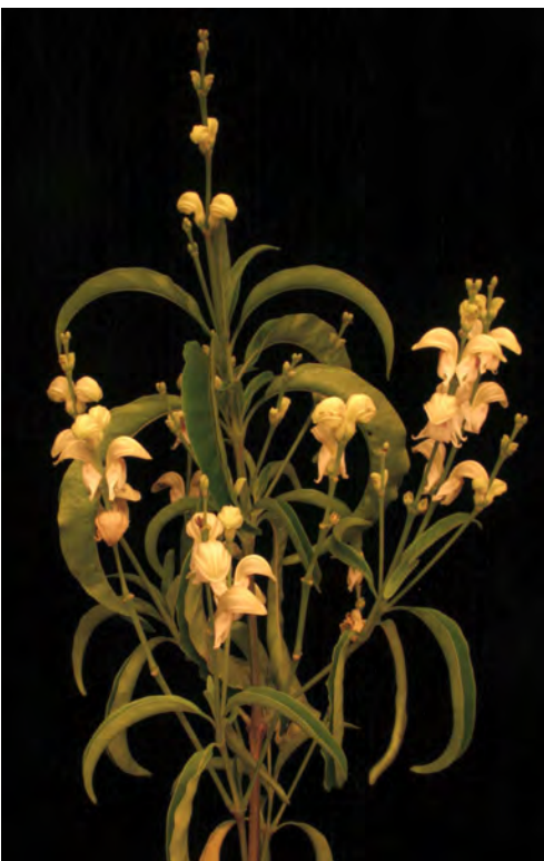
Duvernoia adhatodoides , sometimes called 'pistol bush'

species for small to medium pots. It will benefit from a rich soil and occasional liquid feed. Available from www.ferncentral.com