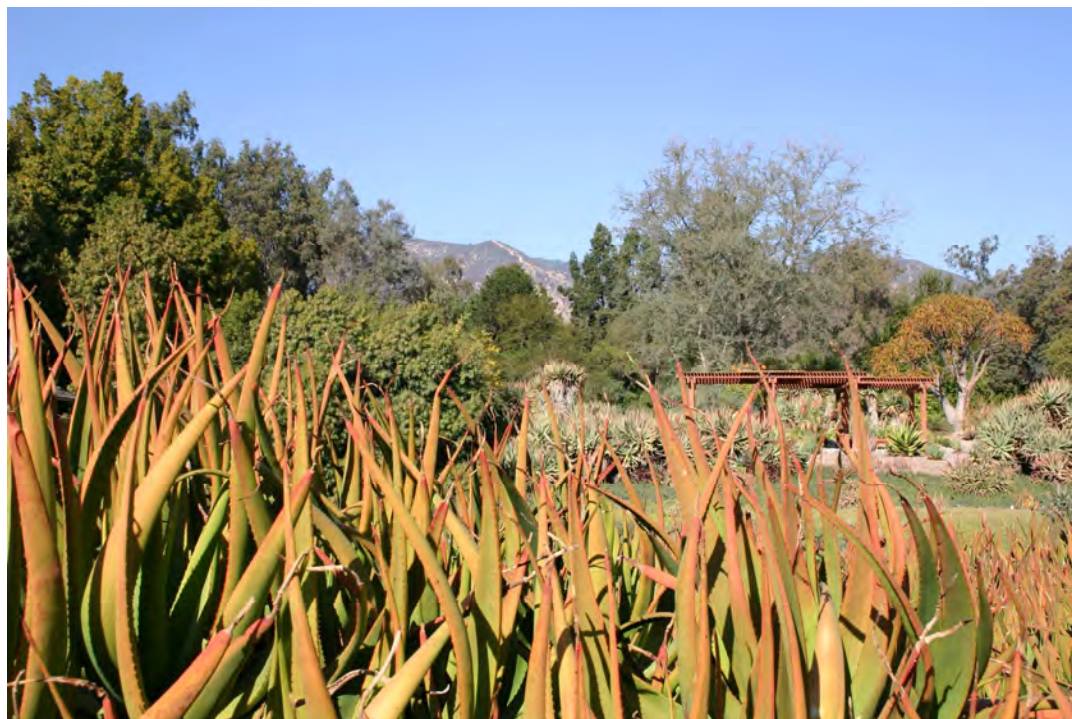
View of the San Gabriel Mountains from the L.A. County Arboretum and Botanic Garden, with hybrid Aloe vryheidensis in the foreground

During the spring we watched the mountains bloom with wildflowers and ephemerals brought on by rain. Before the summer