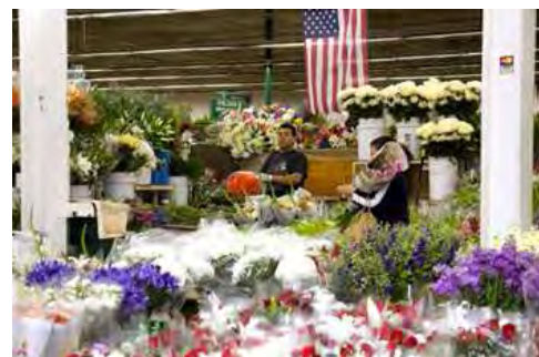
The January Opportunity Drawing will be a selection of items from the Los Angeles Flower District, pictured at right